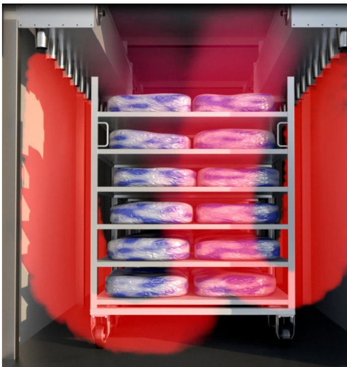
Fig. Thawing Process