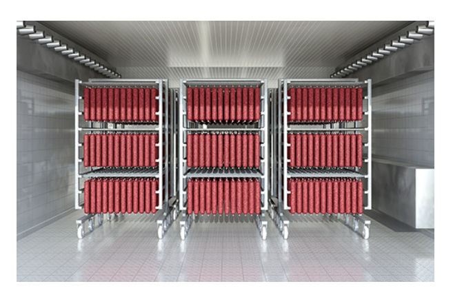
Fig.1 Air distribution with horizontal system