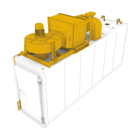
Fig 1.: One-row 1x5

Our installations are available as single or double row installations.